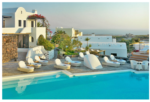
Santorini, Luxury Collection