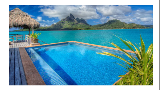
The St. Regis Bora Bora Resort