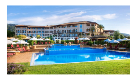
The St. Regis Mardavall Mallorca Resort

You may enjoy all the privileges that come with your new upgraded status starting February 15, 2017.