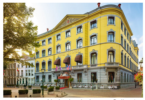
Netherlands, Luxury Collection