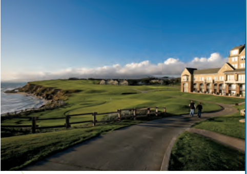
The Ritz-Carlton, Half Moon Bay

To reserve either offer, please contact Member Services at 888.220.2084 and request the Complimentary Wine Flight OR the Spa Enhancement offer.