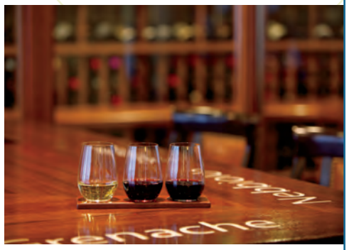
Eno Wine Bar, Half Moon Bay