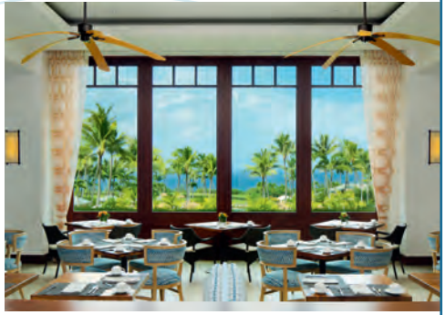
The Ritz-Carlton, Kapalua