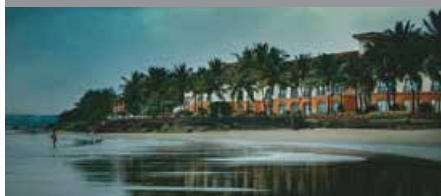
Goa Marriott Resort & Spa

Club Points Per Night: 6,000 - Standard Room