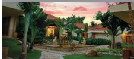
Sanya Marriott Yalong Bay Resort & Spa

Club Points Per Night: 7,000 - Standard Room