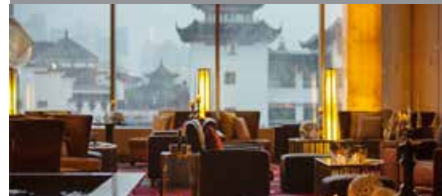
Renaissance Shanghai Yu Garden Hotel

Club Points Per Night: 5,000 - Standard Room