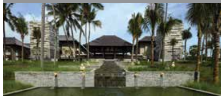
Courtyard by Marriott Bali Nusa Dua

Club Points Per Night: 3,500 - Deluxe Pool View Room