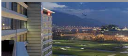
Hong Kong SkyCity Marriott Hotel

Club Points Per Night: 4,500 - Standard Room