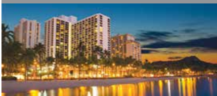
Waikiki Beach Marriott Resort & Spa* Club Points Per Night: 7,500 - Standard Room (Sun - Thu) 8,500 - Standard Room (Fri & Sat)