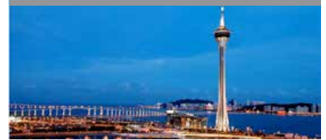
JW Marriott Hotel Macau*

Club Points Per Night: 6,500 - Standard Room (Sun - Thu) 7,500 - Standard Room (Fri & Sat)