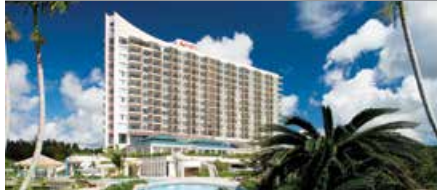
Okinawa Marriott Resort & Spa Club Points Per Night: 6,500 - Standard Room