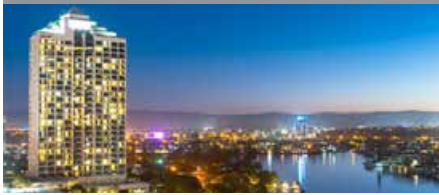
Surfers Paradise Marriott Resort & Spa Club Points Per Night: 4,000 - Standard Room