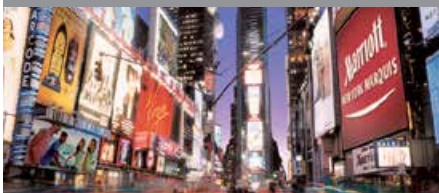
New York Marriott Marquis Club Points Per Night: 12,000 - 17,750 - Standard King Room 14,250 - 18,500 - Standard Double Bed Room