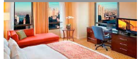
New York Marriott at the Brooklyn Bridge Club Points Per Night: 10,000 - 14,750 - Standard King Room 12,250 - 15,500 - Standard Double Bed Room