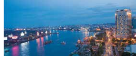
Renaissance Riverside Hotel Saigon Club Points Per Night: 4,500 - Standard Room