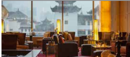
Renaissance Shanghai Yu Garden Hotel

Club Points Per Night: 5,000 - Standard Room