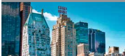
JW Marriott Essex House New York Club Points Per Night: 11,000 - 19,000 - Standard Room 14,000 - 22,250 - Junior Suite