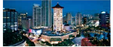
Singapore Marriott Hotel Club Points Per Night: 8,000 - Standard Room