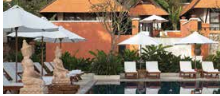
Renaissance Koh Samui Resort & Spa Club Points Per Night: 5,000 - Standard Room