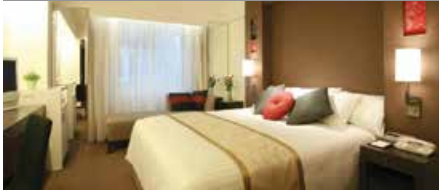
Courtyard by Marriott Tokyo Ginza Hotel Club Points Per Night: 5,500 - Standard Room