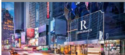
Renaissance New York Times Square Hotel Club Points Per Night: 12,000 - 17,750 - Standard King Room 14,250 - 18,500 - Standard Double Bed Room