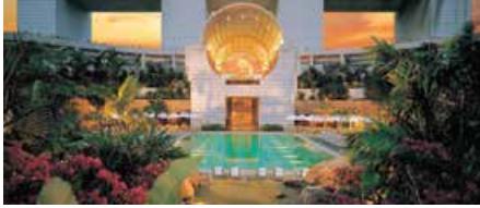
The Ritz-Carlton, Millenia Singapore Club Points Per Night: 6,500 - Standard Room Note: Only available for reservations on Friday, Saturday & Sunday nights