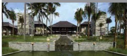
Courtyard by Marriott Bali Nusa Dua

Club Points Per Night: 3,500 - Deluxe Pool View Room