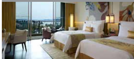
Renaissance Sanya Resort & Spa

Club Points Per Night: 5,000 - Standard Room