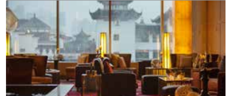
Renaissance Shanghai Yu Garden Hotel

Club Points Per Night: 5,000 - Standard Room