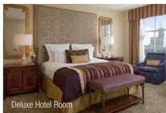
Deluxe Hotel Room