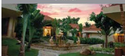
Sanya Marriott Yalong Bay Resort & Spa

Club Points Per Night: 7,000 - Standard Room