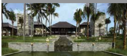
Courtyard by Marriott Bali Nusa Dua

Club Points Per Night: 3,500 - Deluxe Pool View Room