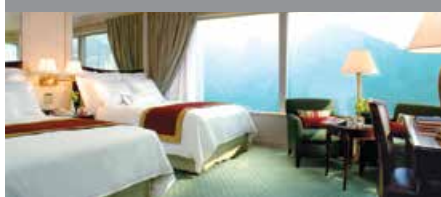
JW Marriott Hotel Hong Kong

Club Points Per Night: 8,000 - Standard Room