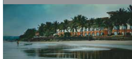
Goa Marriott Resort & Spa

Club Points Per Night: 6,000 - Standard Room