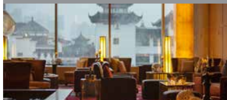
Renaissance Shanghai Yu Garden Hotel

Club Points Per Night: 5,000 - Standard Room