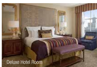
Deluxe Hotel Room