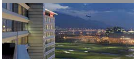
Hong Kong SkyCity Marriott Hotel

Club Points Per Night: 4,500 - Standard Room