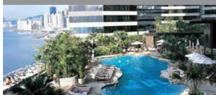
Renaissance Harbour View Hotel Hong Kong

Club Points Per Night: 6,500 - Standard Room