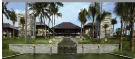
Courtyard by Marriott Bali Nusa Dua

Club Points Per Night: 3,500 - Deluxe Pool View Room