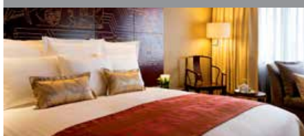
China Hotel, A Marriott Hotel, Guangzhou

Club Points Per Night: 4,000 - Standard Room