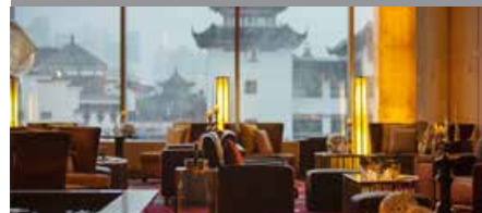
Renaissance Shanghai Yu Garden Hotel

Club Points Per Night: 5,000 - Standard Room