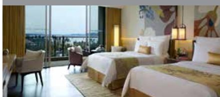
Renaissance Sanya Resort & Spa

Club Points Per Night: 5,000 - Standard Room