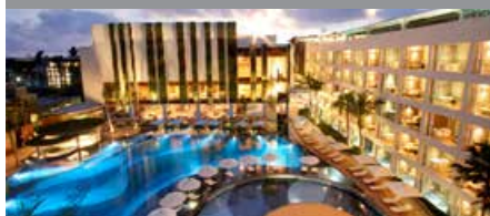
The Stones Hotel - Legian Bali

Club Points Per Night: 4,500 - Standard Room