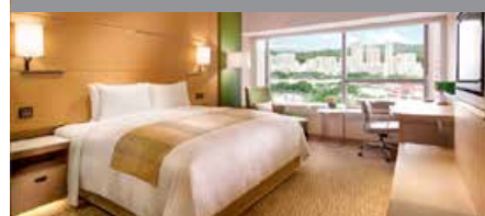
Courtyard by Marriott Hong Kong Sha Tin

Club Points Per Night: 3,500 - Standard Room