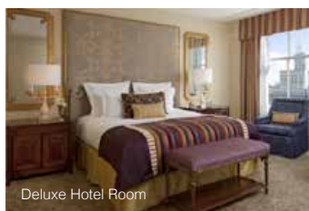
Deluxe Hotel Room