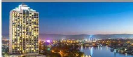
Surfers Paradise Marriott Resort & Spa Club Points Per Night: 4,000 - Standard Room