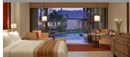
The Ritz-Carlton, Bali* Club Points Per Night: 11,000 - 12,500 - Sawangan Junior Suite