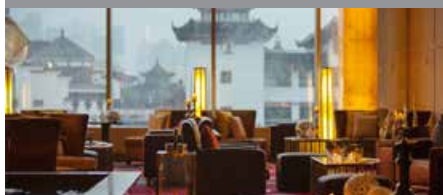
Renaissance Shanghai Yu Garden Hotel Club Points Per Night: 5,000 - Standard Room