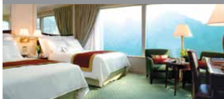
JW Marriott Hotel Hong Kong Club Points Per Night: 8,000 - Standard Room