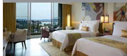
Renaissance Sanya Resort & Spa Club Points Per Night: 5,000 - Standard Room