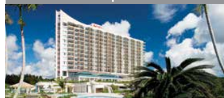
Okinawa Marriott Resort & Spa Club Points Per Night: 6,500 - Standard Room