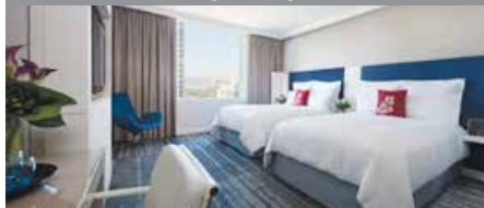
Sydney Harbour Marriott Hotel at Circular Quay Club Points Per Night: 7,000 - Standard Room