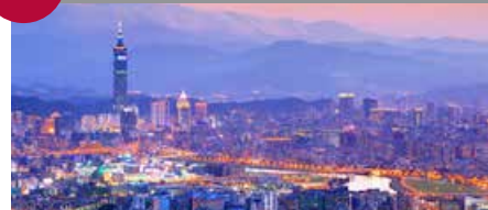
Taipei Marriott Hotel* Club Points Per Night: 10,000 - Standard Room