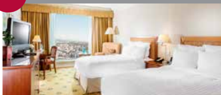
Brisbane Marriott Hotel* Club Points Per Night: 5,500 - Standard Room (Sunday - Thursday nights) 4,250 - Standard Room (Friday & Saturday nights)