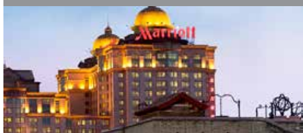
Beijing Marriott Hotel City Wall Club Points Per Night: 4,500 - Standard Room