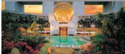
The Ritz-Carlton, Millenia Singapore Club Points Per Night: 6,500 - Standard Room Note: Only available for reservations on Friday, Saturday & Sunday nights