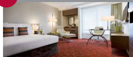
Melbourne Marriott Hotel* Club Points Per Night: 4,250 - Standard Room (15 Aug - 12 Oct; 11 Dec - 31 Dec) 5,250 - Standard Room (13 Oct - 10 Dec)