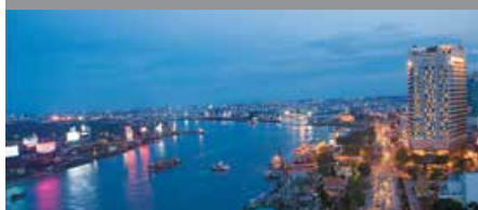
Renaissance Riverside Hotel Saigon Club Points Per Night: 4,500 - Standard Room