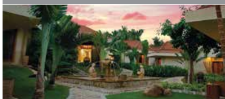
Sanya Marriott Yalong Bay Resort & Spa Club Points Per Night: 7,000 - Standard Room