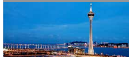
JW Marriott Hotel Macau Club Points Per Night: 6,500 - Standard Room (Sunday - Thursday nights) 7,500 - Standard Room (Friday & Saturday nights)