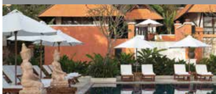
Renaissance Koh Samui Resort & Spa Club Points Per Night: 5,000 - Standard Room