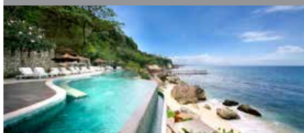
AYANA Resort & Spa, Bali Club Points Per Night: 7,500 - Standard Room Club Points Per Night: 6,500 - (Jimbaran Bay Room at RIMBA Jimbaran Bali by AYANA)