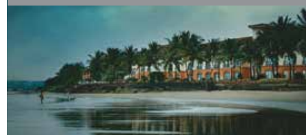
Goa Marriott Resort & Spa Club Points Per Night: 6,000 - Standard Room