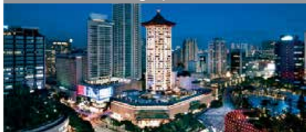
Singapore Marriott Tang Plaza Hotel Club Points Per Night: 8,000 - Standard Room