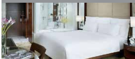
Langham Place, Mongkok, Hong Kong Club Points Per Night: 5,500 - Essential Place