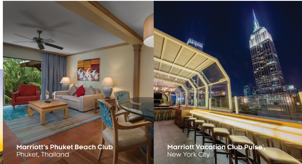
Marriott's Phuket Beach Club Phuket, Thailand