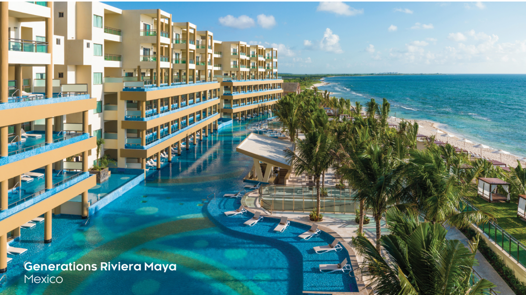
Generations Riviera Maya Mexico

Explore the Entire Globe — Around the World in 80 Nations.