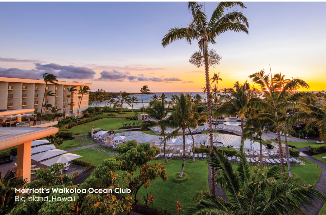
Marriott's Waikoloa Ocean Club Big Island, Hawaii

Spread out. Settle in. And make yourself at home with an elegant villa vacation. With access to more than 50 magnificent Marriott Vacation Club resorts, you have an upscale home away from home awaiting you around the globe. From deluxe studios to 1-, 2- and 3-bedroom villas and townhouses in select locations, our premium villas are perfect for an unforgettable extended vacation or memory-making family reunion.