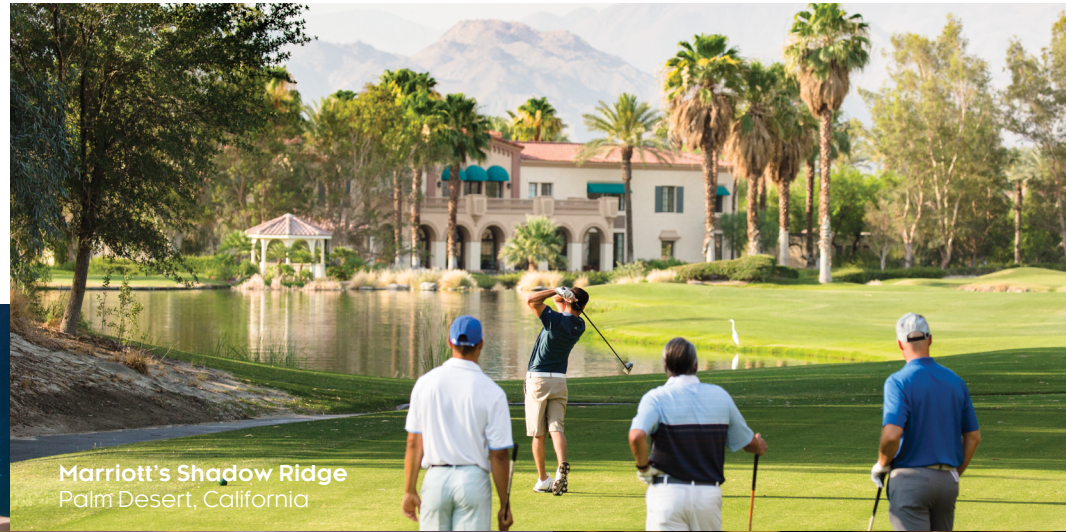
Marriott's Shadow Ridge Palm Desert, California