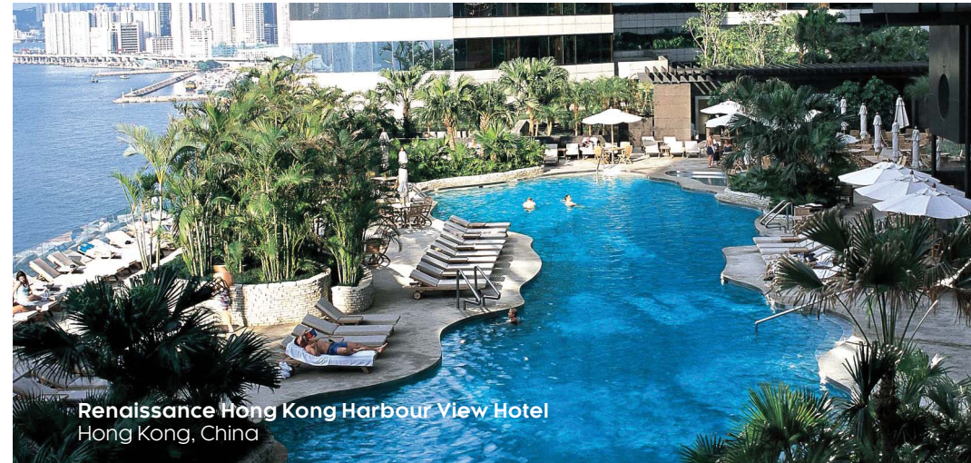
Renaissance Hong Kong Harbour View Hotel Hong Kong, China

Owners with up to 3,999 Vacation Club Points annually may trade up to 50% of their annual distribution of Vacation Club Points for Marriott Bonvoy Points each year. Only Vacation Club Points associated with Beneficial Interests in the Marriott Vacation Club Destinations Program may be traded for Marriott Bonvoy Points. Owners enrolled in the Marriott Vacation Club Destinations Exchange Program may continue to trade eligible weeks for Marriott Bonvoy Points.